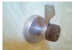
Old Mixet Valve #2