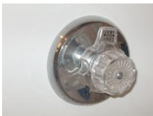
Old Mixet Valve #1

Some owners have reported that they are having issues with their water temperature and pressure. According to the plumbers, the original and old Mixet valves have cartridges inside that go bad over time. Once this happens it can compromise the water pressure and or water temperature in your unit or the unit of others in your building. We understand many have already replaced their shower/tub valves, but some units still have the original Mixet Valves, which would be attributing to issues in the water to other residents in their building. There are two sample photos below for reference. Owners will need to check or have their plumber's check. We encourage all owners with the old Mixet valves to have them replaced, to ensure you are not contributing to water issues in your building. Let's all work together on this issue!