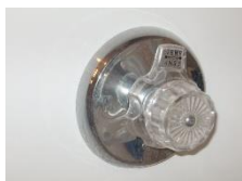
Old Mixet Valve #1

Some owners have reported that they are having issues with their water temperature and pressure. According to the plumbers, the original and old Mixet valves have cartridges inside that go bad over time. Once this happens it can compromise the water pressure and or water temperature in your unit or the unit of others in your building. We understand many have already replaced their shower/tub valves, but some units still have the original Mixet Valves, which would be attributing to issues in the water to other residents in their building. There are two sample photos below for reference. Owners will need to check or have their plumber's check. We encourage all owners with the old Mixet valves to have them replaced, to ensure you are not contributing to water issues in your building. Let's all work together on this issue!