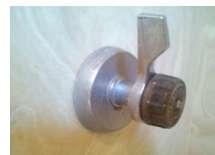
Old Mixet Valve #2