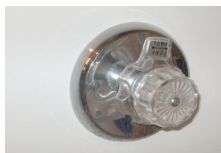
Old Mixet Valve #1

Some owners have reported that they are having issues with their water temperature and pressure. According to the plumbers, the original and old Mixet valves have cartridges inside that go bad over time. Once this happens it can compromise the water pressure and or water temperature in your unit or the unit of others in your building. We understand many have already replaced their shower/tub valves, but some units still have the original Mixet Valves, which would be attributing to issues in the water to other residents in their building. There are two sample photos below for reference. Owners will need to check or have their plumber's check. We encourage all owners with the old Mixet valves to have them replaced, to ensure you are not contributing to water issues in your building. Let's all work together on this issue!